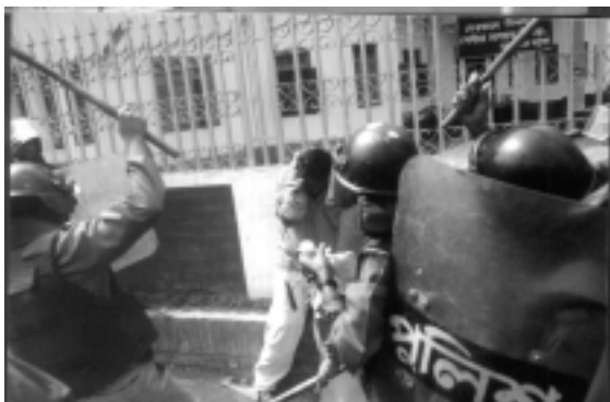
Living in fear – violence permeates Bangladeshi Society, with little or no respect for human rights, life or security.

throughout Bangladesh, violence is committed daily in a wide range of social, political and religious institutions, particularly against women. It is often defended on ideological grounds, and a general ethos of intolerance permits daily acts of brutality to continue unabated. Such violence may constitute torture in cases where the state is cognisant of what is happening and does nothing to stop it.