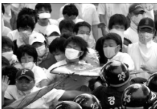
Riot police using purposefully sharpened shields as weapons. South Korea still violently represses demonstrations – a problem common throughout Asia.

International observers have noted with concern increasing riot police brutality in the last three years. For instance, riot police brutally attacked protesters in Buan County who held demonstrations against the government's plan to construct a nuclear waste storage facility in the country in 2003. An estimated 100 people were injured. In March 2005, the National Human Rights Commission (NHRC) of Korea issued recommendations regarding this matter. It concluded that the police's excessive repression violated the rights of the Buan protesters and urged the Korean National Police Agency to compensate the victims. The NHRC of Korea also opined that the prohibition of demonstrations at night has no legal justification. The police have maintained that demonstrations at night are illegal and have attempted to punish protesters who participated in such demonstrations. The Korean National Police Agency has shown reluctance to implement the NHRC's recommendations.