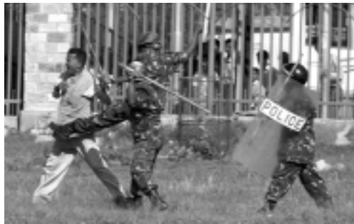
A law unto themselves: the police and army are free to beat, torture and kill in all impunity in Nepal.

A halt to the conflict would, of course, facilitate the process of institution building, and remove some of the justifications for continuing widespread human rights violations. The resumption of multi party democracy and the end to the emergency powers handed to the military are vital in enabling positive change. However, for real and lasting improvement to the situation and the prevention of future violations, the rule of law must be established. In a country where the institutions, such as the judiciary and the legislature, as well as the policing system, have all but collapsed, they must be rebuilt. It is imperative that this be done with all speed, so as not to lose previously available expertise present within the system. If not done rapidly, a vacuum will be formed in the space normally occupied by such institutions within a functioning State, which will be particularly difficult to remove if established.