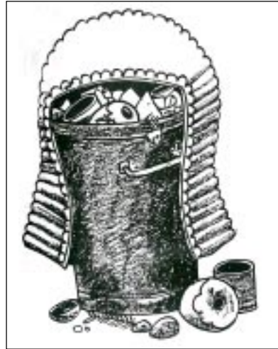
Image of the judiciary – this is by the cartoonist of the Ravaya weekly paper, reprinted from the book 'An Unfinished Struggle' (536 pages), an investigative exposure of the Sri Lankan judiciary and the Chief Justice by Victor Ivan – courtesy of Ravaya.

The State party should take the necessary measures to ensure that justice is not delayed [CAT/C/LKA/CO/1/CRP.2].