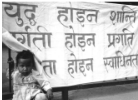
A generation in despair: a young child at a peace rally. Children are particularly at risk of abuse in the conflict in Nepal.

UN recommendation - Nepal should: take necessary steps to protect juveniles from breaches to the Convention (against Torture),