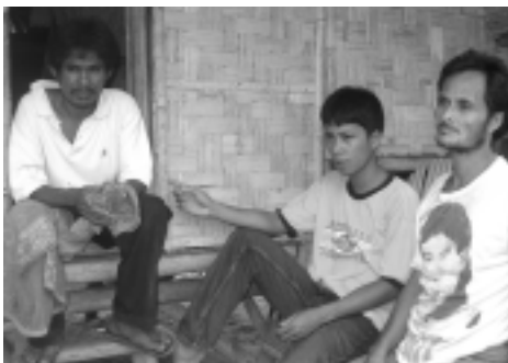
Prolonged trauma for torture victims – a continuing abuse. These farmers in Sultan Kudarat, among others, receive no treatment or rehabilitation from the government following severe torture.

Since February 2004, the AHRC has reported on 16 cases of severe torture across the Philippines. These are merely cases reported to the AHRC and no doubt represent only a fraction of the problem. Even though torture is widespread throughout the country, the lack of proper and efficient documentation of cases, even by human rights NGOs, remains an issue. Not a single perpetrator has been punished for torture, despite the alarming and increasing number of torture cases. One of the main reasons for this lies in the Government's failure to enact effective legislation on torture.